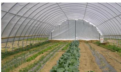
Example of high tunnels

Regulations: Bees are integral to pollination, plant health, and vegetable and fruit production industries. The right to keep bees is protected by the Tennessee State Apiary Act of 1995. While bees pose little risk to the general population, the Office of Sustainability is sensitive to those with bee allergies and the dangers of general proximity to beehives. In crafting the language about apiaries within the City, the Office of Sustainability referred to best practices from cities that had addressed urban beekeeping in zoning ordinances and consulted with the University of Tennessee extension agents.