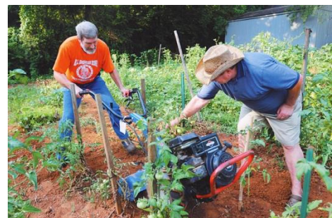
Community Action Committee GreenThumb

Regulations: A community garden represents the gardening interests of multiple non-family members. This allows for garden clubs, non-profits, or other community organizations to establish gardens for their membership. A community garden is space shared by multiple individuals or groups of individuals