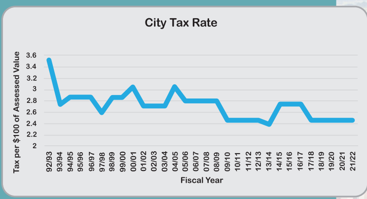
Chart A